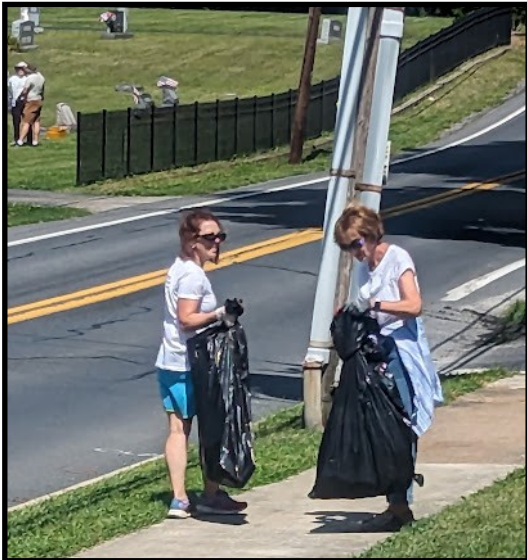
Members cleaning up around the church and cemetery.