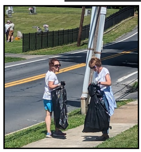
Members cleaning up around the church and cemetery.